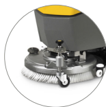
External wheel, adjustable pressure