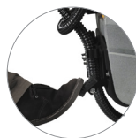
Foot pedal squeegee lifting system