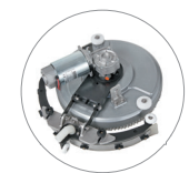
Squeegee and rotation (up to 270° rotation)