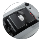
Kit Hybrid (for Hybrid version)