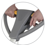
New ergonomic Handle