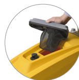
Removable lid + floating ball + filter