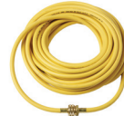
15 M FLEXIBLE HOSE WITH FITTINGS CODE TBFX40008