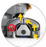
Compact dimensions to go and work where no one arrives