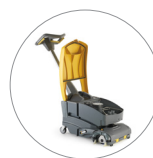
Easy to transport, park, store