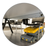
Fast and easy maintenance