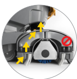
Alternate twin squeegee system (patented)