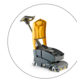
Fast and easy maintenance