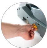
Adjustable down pressure by knob (3 steps)