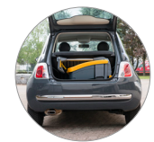
Easy to transport, park, store