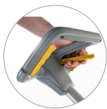
Ergonomic handle with unlocking system