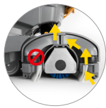
Alternate twin squeegee system (patented)