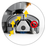
Compact dimensions to go and work where no one arrives