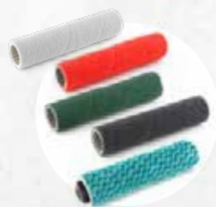
CYLINDRICAL PADS WHITE cod. 40.5000.11 RED cod. 40.5000.12 GREEN cod. 40.5000.13 BLACK cod. 40.5000.14 MICROFIBER cod. 40.5000.04**