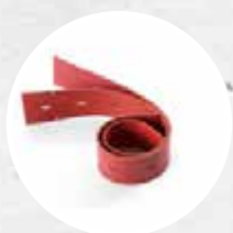
SET FRONT/REAR RUBBER SQUEEGEE BLADE cod. 96.0085.00