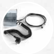
24V 10A CHARGER cod. 22.0619.01