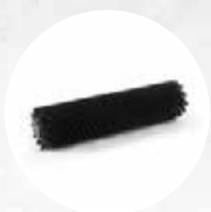
TYNEX CYLINDRICAL BRUSH GRIT 360 cod. 40.5000.03