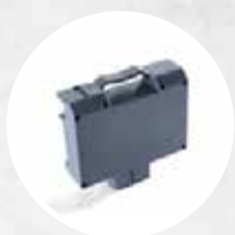
CASE BATTERIES LITHIUM 24V 280WH (for 10Ah version) cod. 22.0571.00