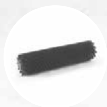
HARD CYLINDRICAL POLYPROPYLENE BRUSH