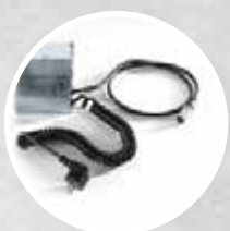
24V 5A CHARGER (for BC version) cod. 22.0619.00