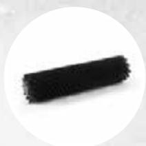
TYNEX CYLINDRICAL BRUSH GRIT 80 cod. 40.5000.08