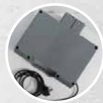
KIT CASE POWER SUPPLY 230V It allows to use battery models M33 as cable ones (standard for E models) cod. 22.0509.00