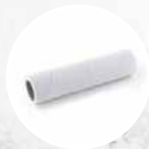
MELAMINE CYLINDRICAL PAD cod. 40.5000.10