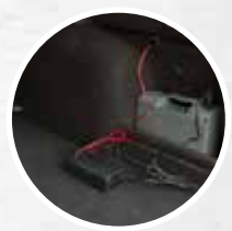
CAR CHARGER 24-12V 3A cod. 18.0065.00