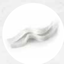
SET FRONT/REAR POLYURETHANE SQUEEGEE BLADE cod. 96.0084.00