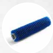
POLYPROPYLENE CYLINDRICAL BLUE BRUSH cod. 40.5000.00