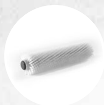
SOFT CYLINDRICAL POLYPROPYLENE BRUSH