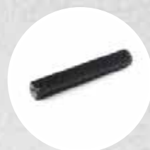
CYLINDRICAL PAD HOLDER cod. 40.5000.06