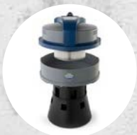
Ultra FilteRing System