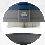
PTFE cartridge filter M filtration class