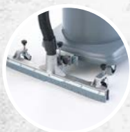
Gangway tool (optional)