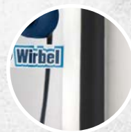
Stainless steel container sturdy and durable