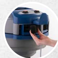
Exhaust air filter