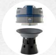
Ultra FilteRing System