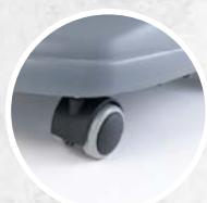
Front swivel castor wheels