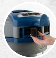
Exhaust air filter