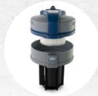
Ultra FilteRing System