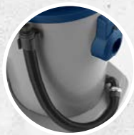
Drain hose to empty the container from liquids (PD).