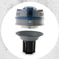
Ultra FilteRing System