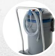
Trolley with handle