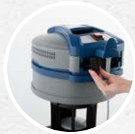
Inlet and outlet of the motor cooling air