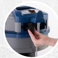
Exhaust air filter