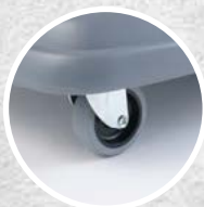
Front swivel castor wheels