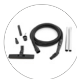
Antistatic accessories (standard for L AS version)