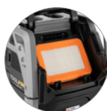
PTFE flat filter