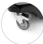
Pivoting wheels with brake