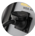
Power tool connection