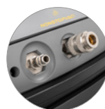
COMBI Kit (optional)