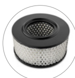
HEPA cartridge filter