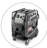
Compact and manageable