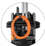
Hooks for accessories and cable holder