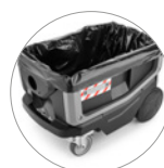
PE bag (optional)