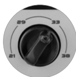
Different diameters of selectable accessories