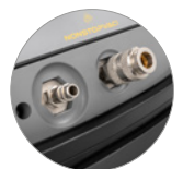
COMBI Kit (optional)