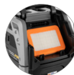
PTFE flat filter